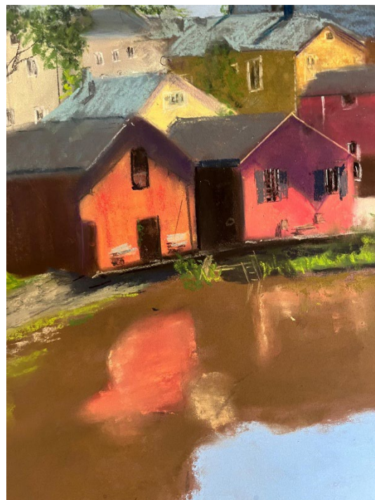
Artwork by students in our pastels art class