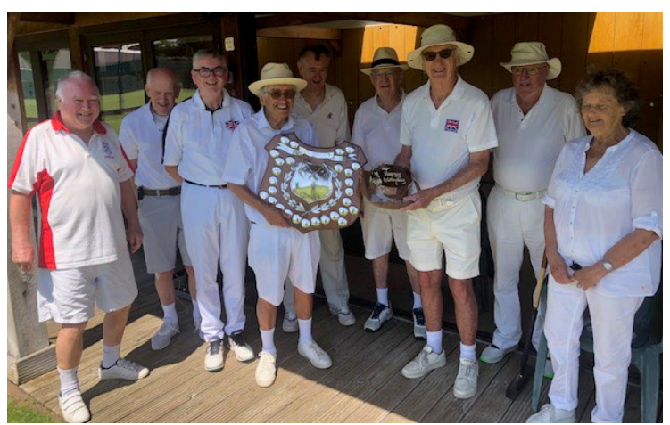
The players, the Shield and the cake

12th - 16th August 2010 USA 14 Australia 7