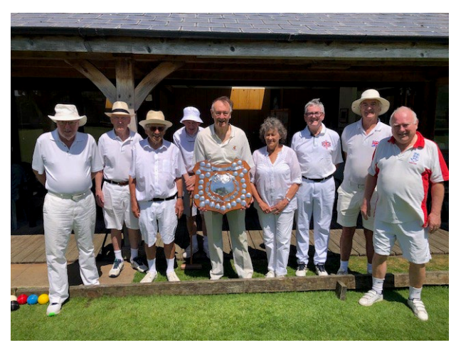
The MacRobertson Shield Centenary players