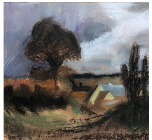
Recent artwork by students in the Beginners and Improvers and Acrylics classes