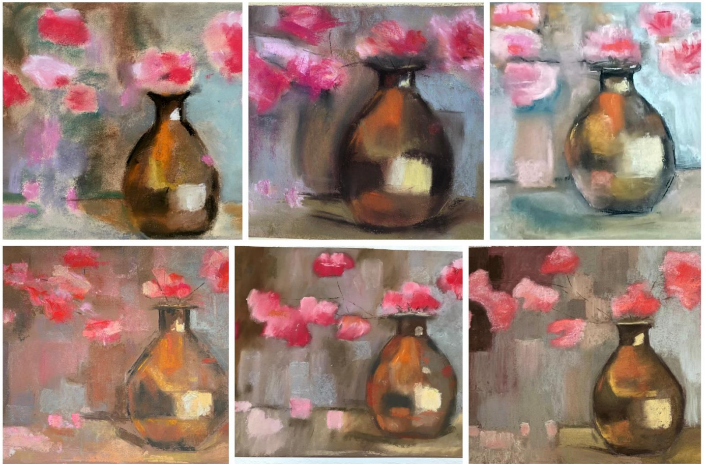
Recent artwork by class students