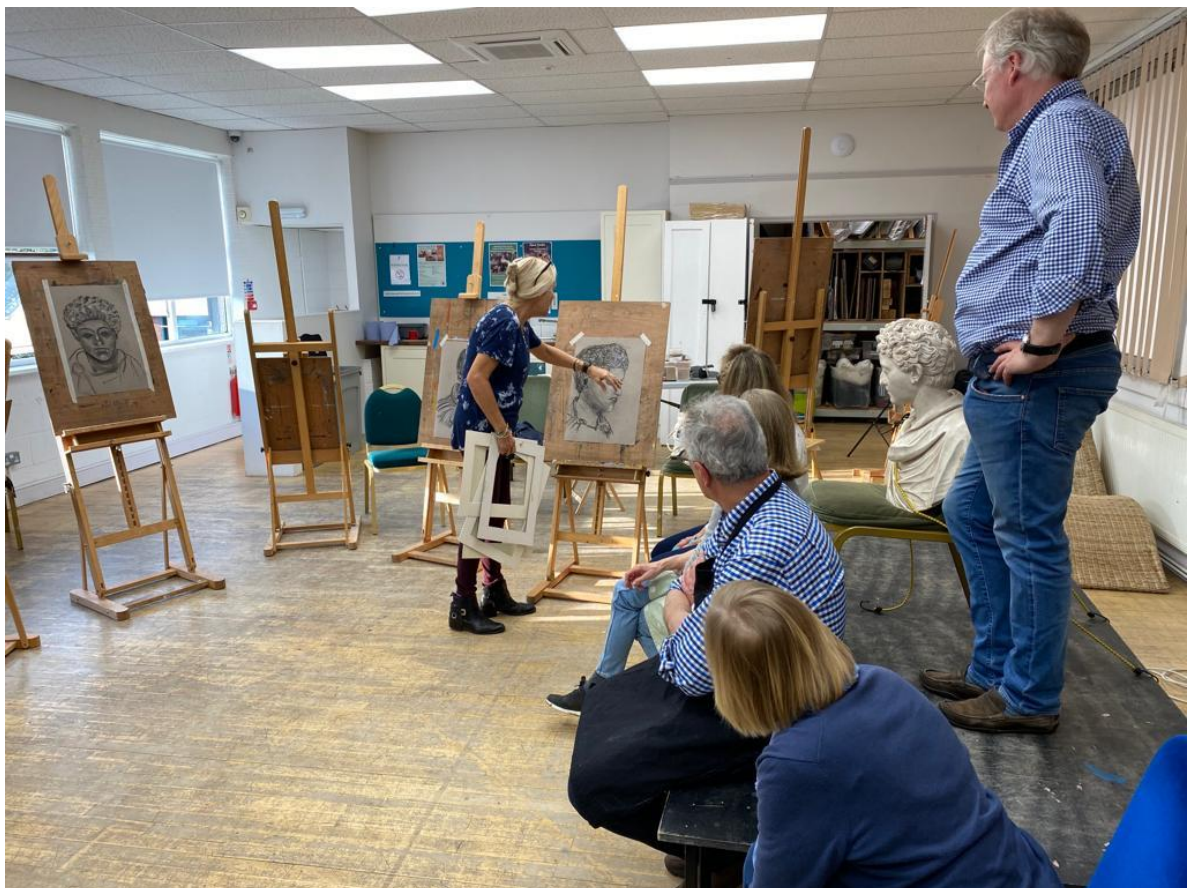
A recent class of Improving drawing students