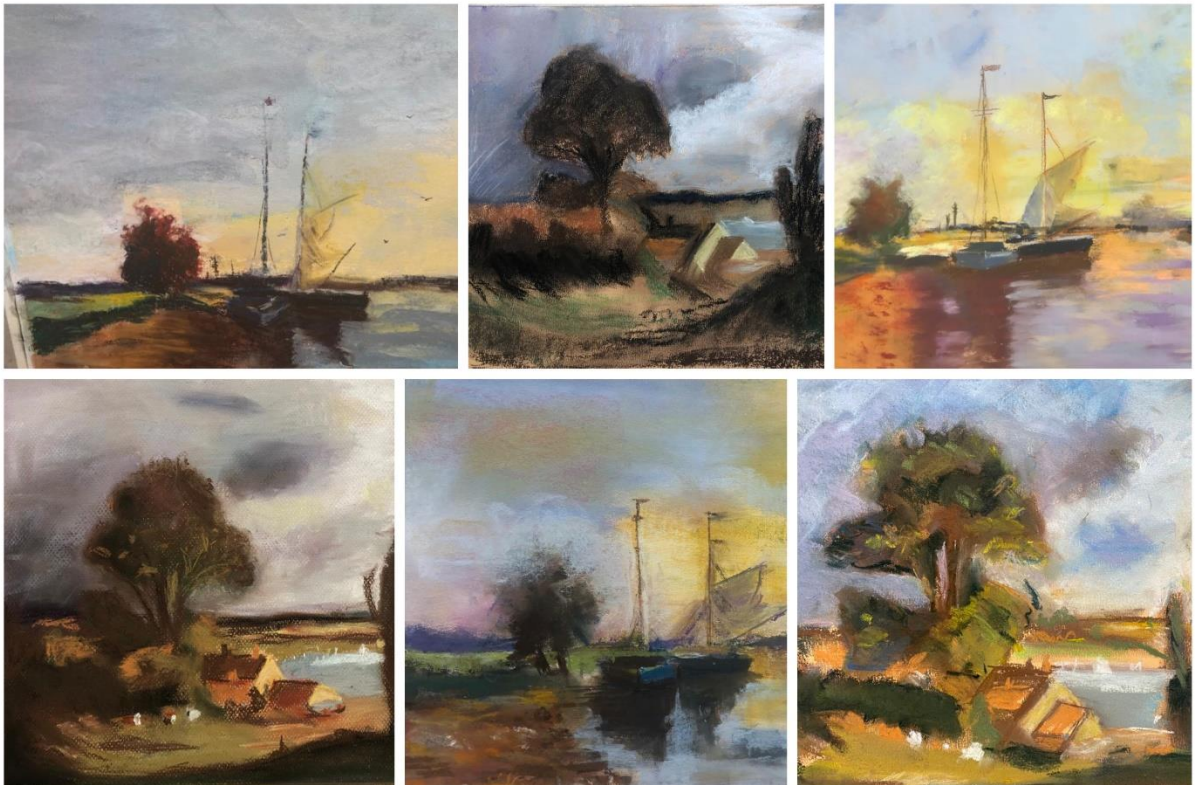
Recent artwork by class students