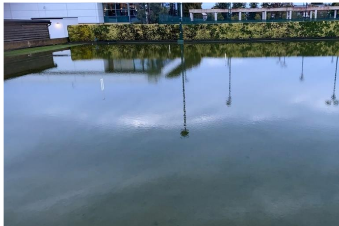
... and, a bacon sandwich later!