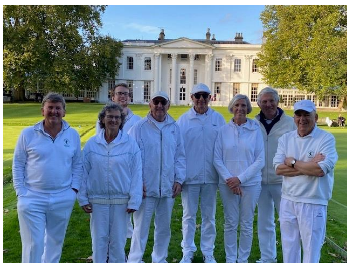
The Roehampton Club Team