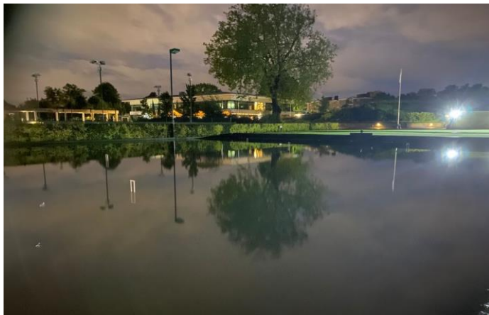
An amazing photograph taken at dawn!

What does 40mm of rain looks like on a croquet lawn!