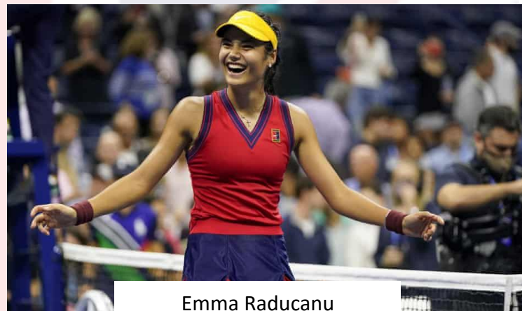
Emma Raducanu Women's Singles Winner