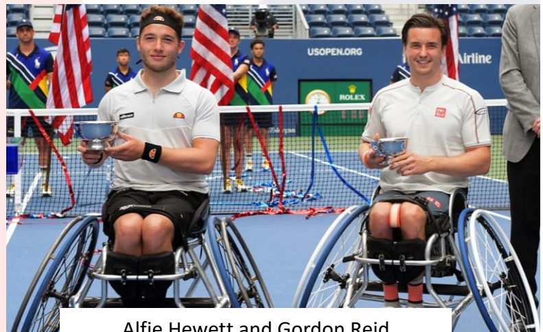
Alfie Hewett and Gordon Reid Wheelchair Men's Doubles Winners