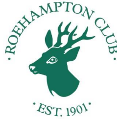
THE SPORTS SHOP