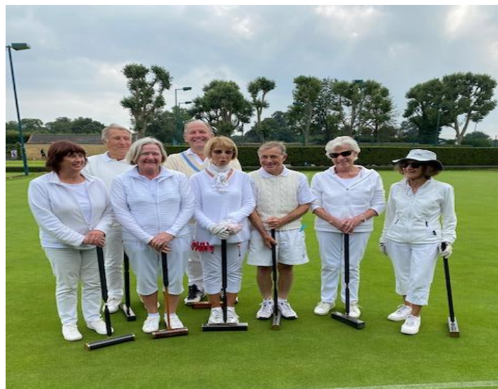
Roehampton Club and Hurlingham Club teams