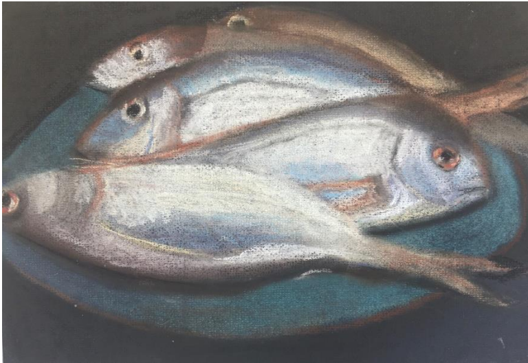
Painting from the Beginners and Improvers Art Class Exhibition in the Reading Room from 28 th August